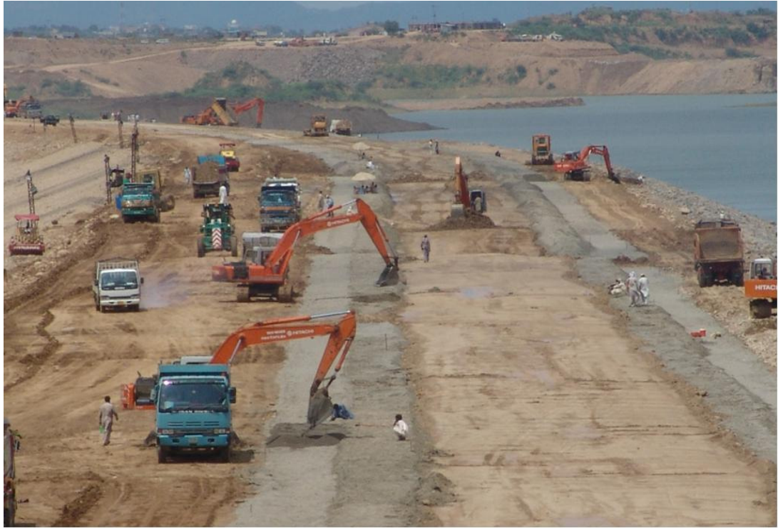
Jari Dam: Filling Works are in Progress