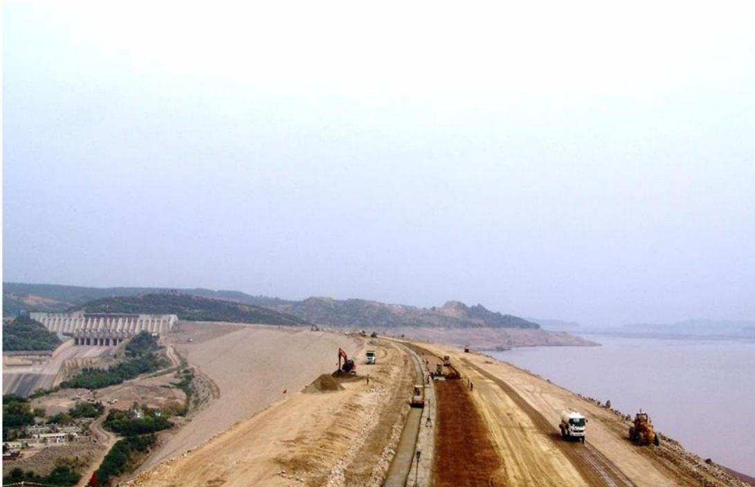
Main Dam: Filling Works are in Progress