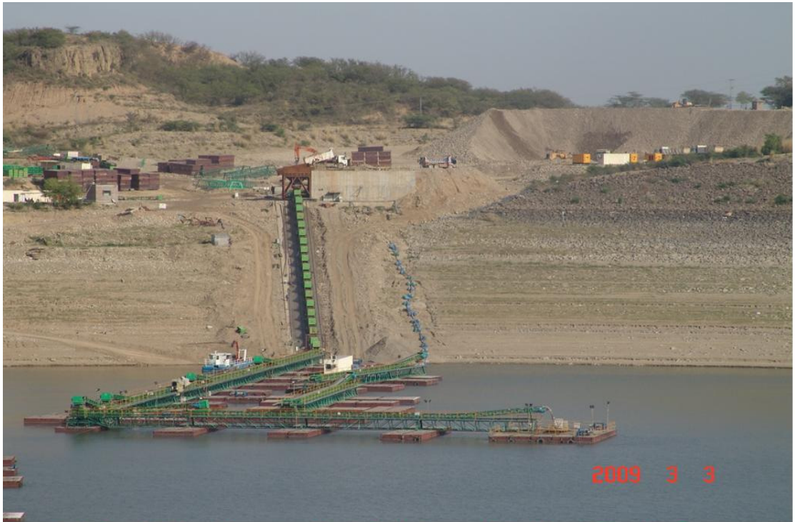
Intake Toe Weight on Upstream of Intake Embankment: Under-Water Filling is in Progress