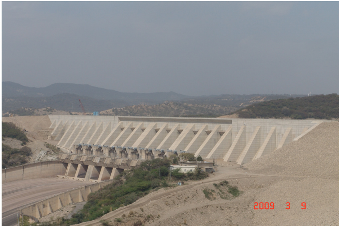
General View of Main Spillway